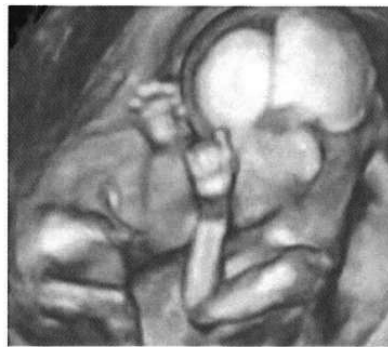
Amici Curiae Brief for the American College of Pediatricians and the Association of American Physicians & Surgeons, Dobbs v. Jackson Women’s Health Organization .

Baby on first page: iStock.com/Mongkolchon Akesin. Model used for illustrative purposes only.